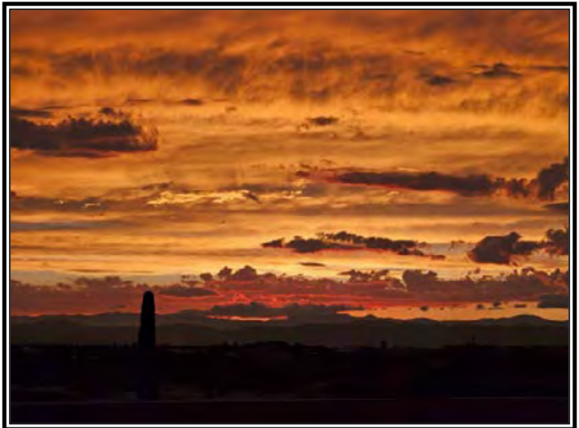
The winning photo of the La Entrada Sunset Photo Contest