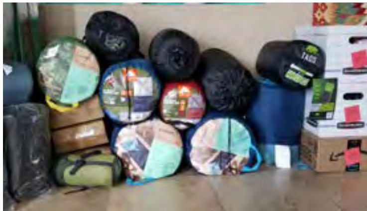
"Christmas in July" donations to Street Outreach

Following a prior success with a "Christmas in July" donation drive, we continued with a collection for Street Outreach July 8-15th. Rancho Viejo Ladies were once again very generous. I delivered our gifts on Monday, July 22nd. We gave 167 Santa Fe Trails Bus Passes; 17 sleeping bags, 64 water bottles and