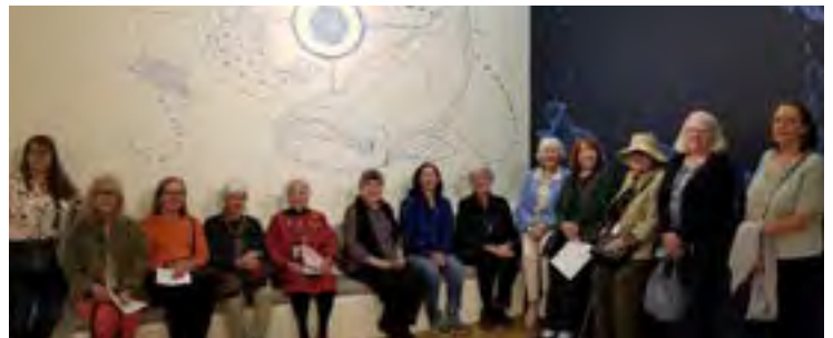
Ladies Tour at Folk Art Museum in April

Supper for April was casual at Sopaipilla Café. Big thanks to Freddie for hosting again. Attendance was about 14. I'm sure the food was good as this is a regular place for our Rancho Viejo brunches.