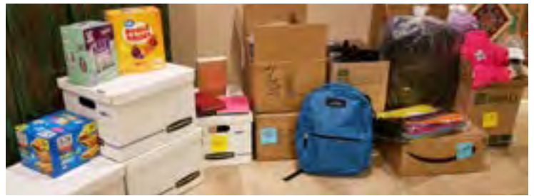
Donations collected for Street Outreach in March