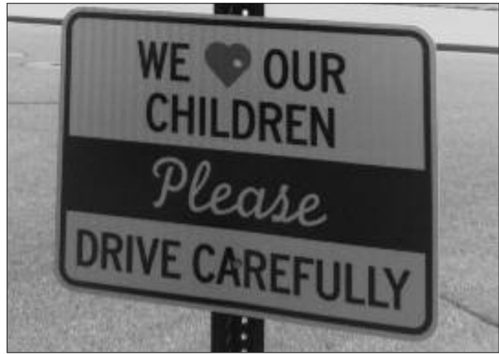
This new sign warns our busy drivers to watch out for kids at play.

RV SOUTH COMMITTEE REPORTS Cont'd from pg. 5