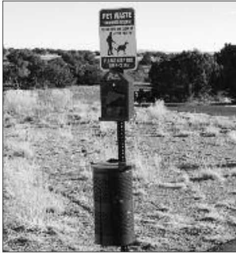
A new doggie station is now up and ready in the South.