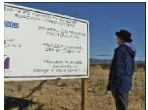
Many Rancho Viejo residents are focused on what's happening in the community. Thanks to their due diligence, Rancho Viejo continues to be a desirable place to live and work. We are grateful to these folks for staying actively involved which is a benefit to us all. Photos on this page are images submitted previously to the Round Up. Thank you to all of the photographers for these images.

Look for "RESIDENT EYES AND EARS" story on page 3.