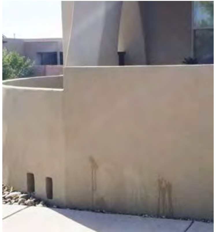
Damage from a pee mail station at one resident's home.

To sum up: Dogs can learn boundaries and your neighbors will thank you.