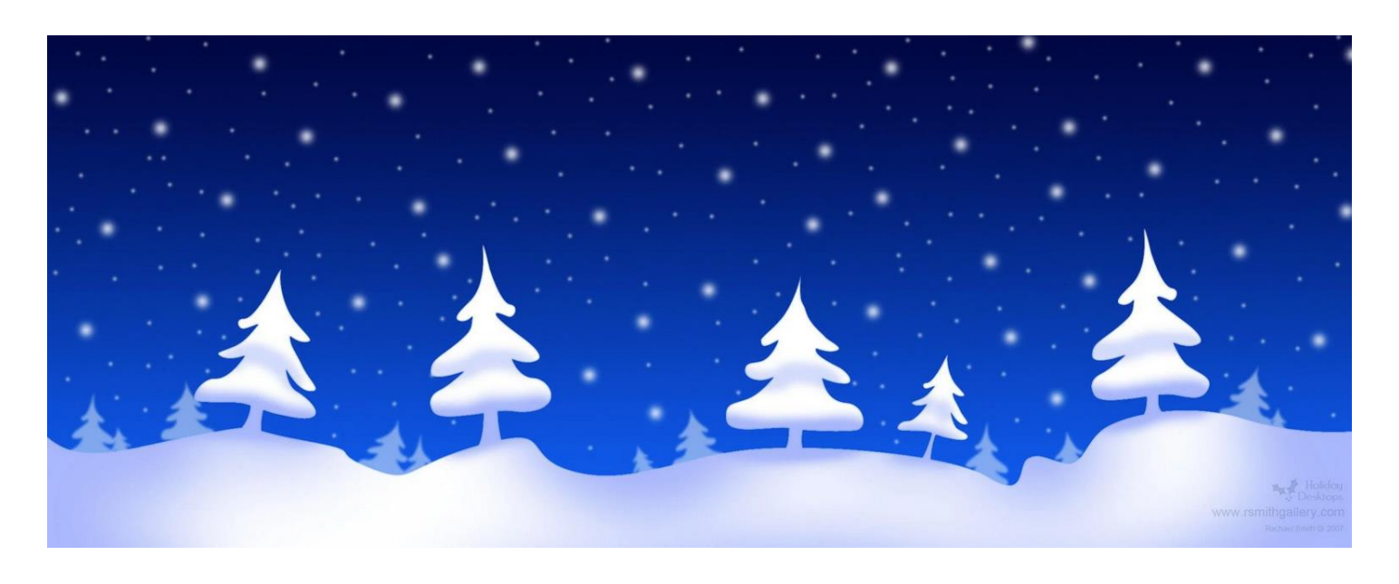
"Wear gratitude like a cloak, and it will feed every corner of your life." — Rumi