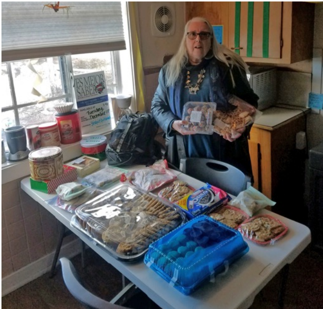
Cookie Glee at the Shelter

Cookies and goodies were divided and packed to bring to both the Fire Station on Rancho Viejo Blvd and the Youth Shelter on St. Francis. Both groups were exuberant to receive the cookies and goodies, especially the staff and clients at the Youth Shelter, where the young people hovered nearby while staff took a picture of our delivery. We're pretty certain those goodies were gobbled up quickly. This was the 8 th or 9 th year we have partnered with the Youth Shelter for this project of holiday good cheer.