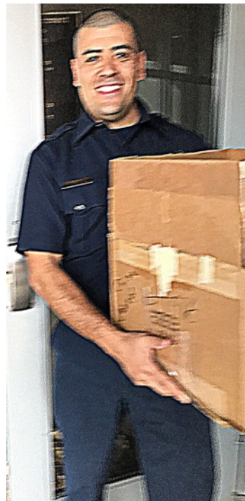
One Happy Fireman!