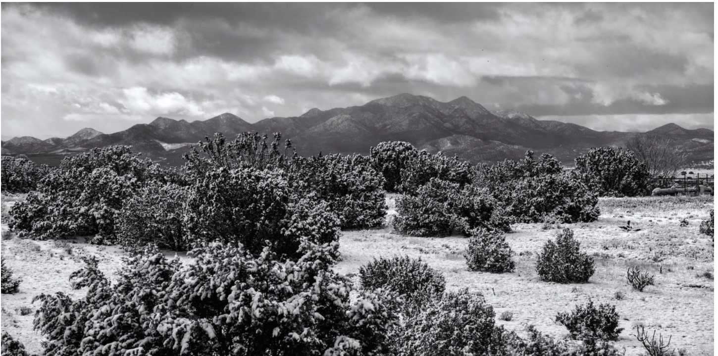
Ortiz Mountains with a little snow as seen from Via Punto Nuevo, 1/21/17.