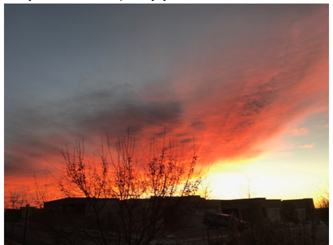
Pink Sky, Photo Credit: Sally Dillon