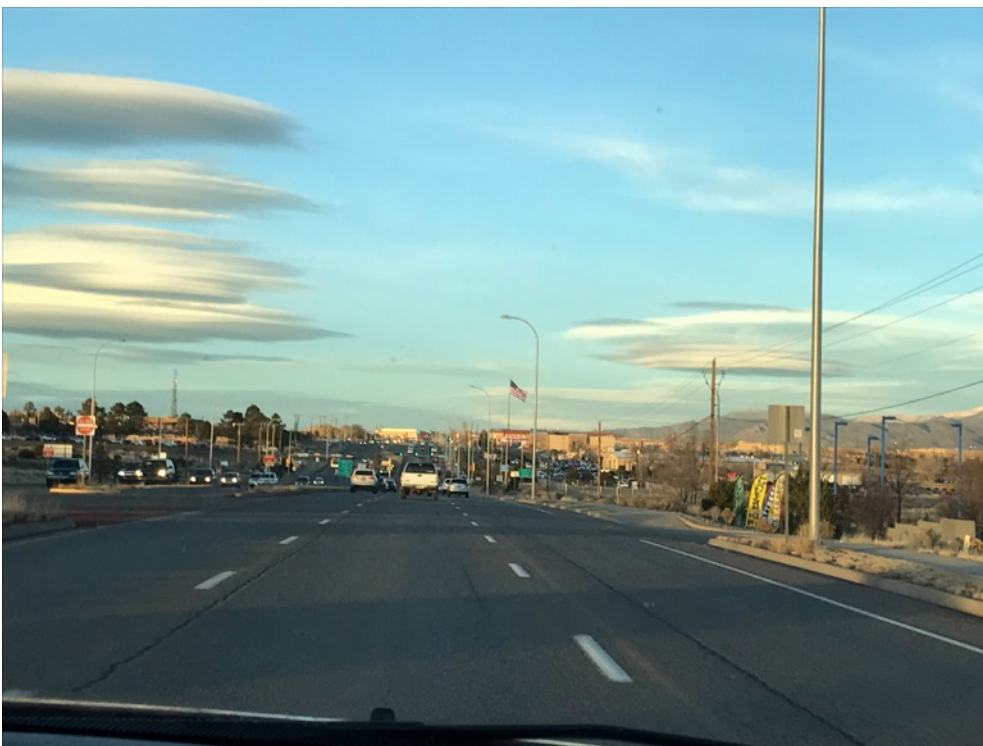
UFO Clouds, Photo Credit: Sally Dillon

Not Allowed: Most electronics, oil or household chemicals.