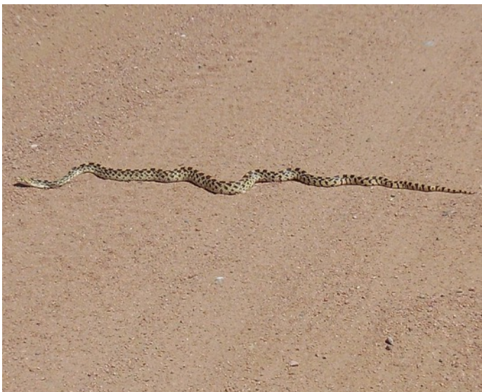
(non poisonous) Bull Snake

The best way to avoid snakes is to stay on designated paths and walk down the middle. When walking with dogs always keep them under control and on a short leash.