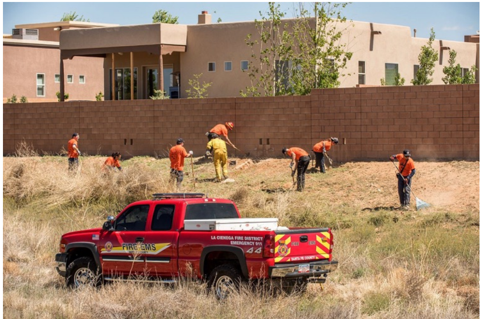
La Cienega Fire Department volunteers work behind Via Punto Nuevo.

Residents from all three Rancho Viejo communities gathered on Saturday morning, May 7th, to share a morning of work and fun. They cleared the land and cleaned up the neighborhoods during the 3rd annual Firewise/USA Community Day.