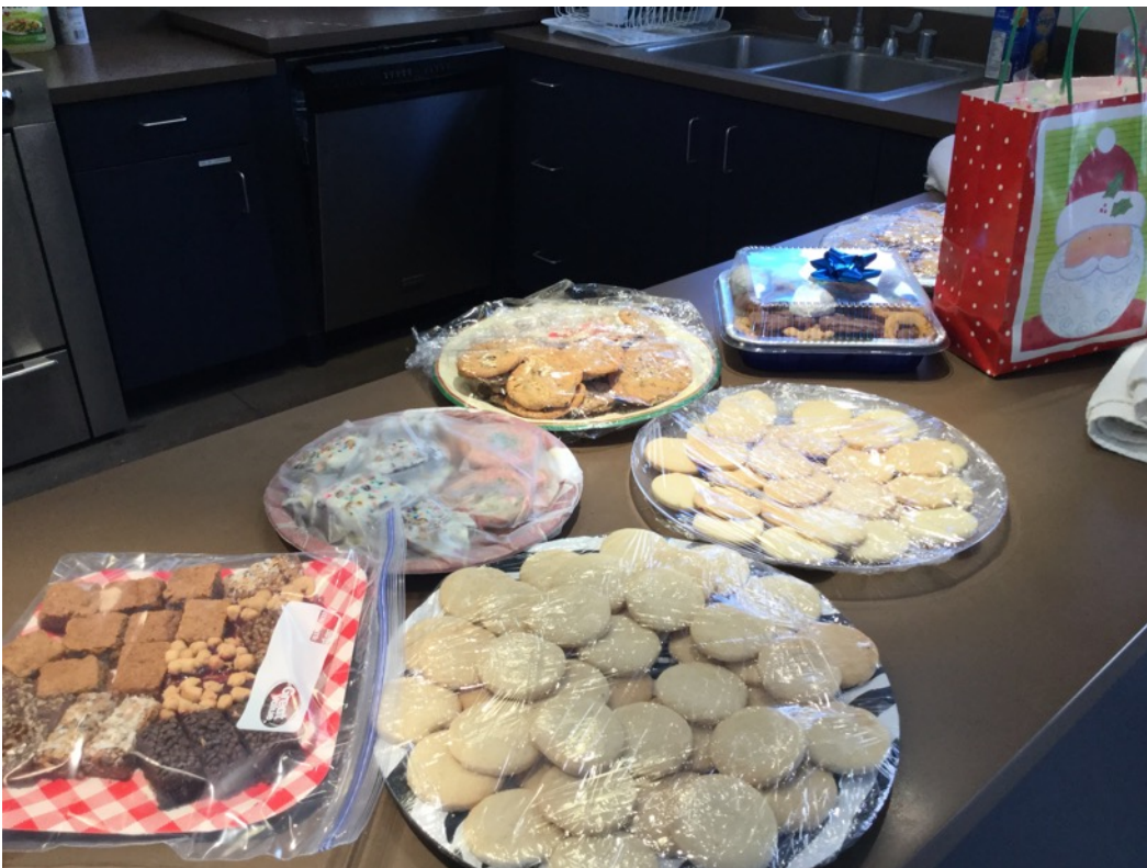
Fire Station Cookies