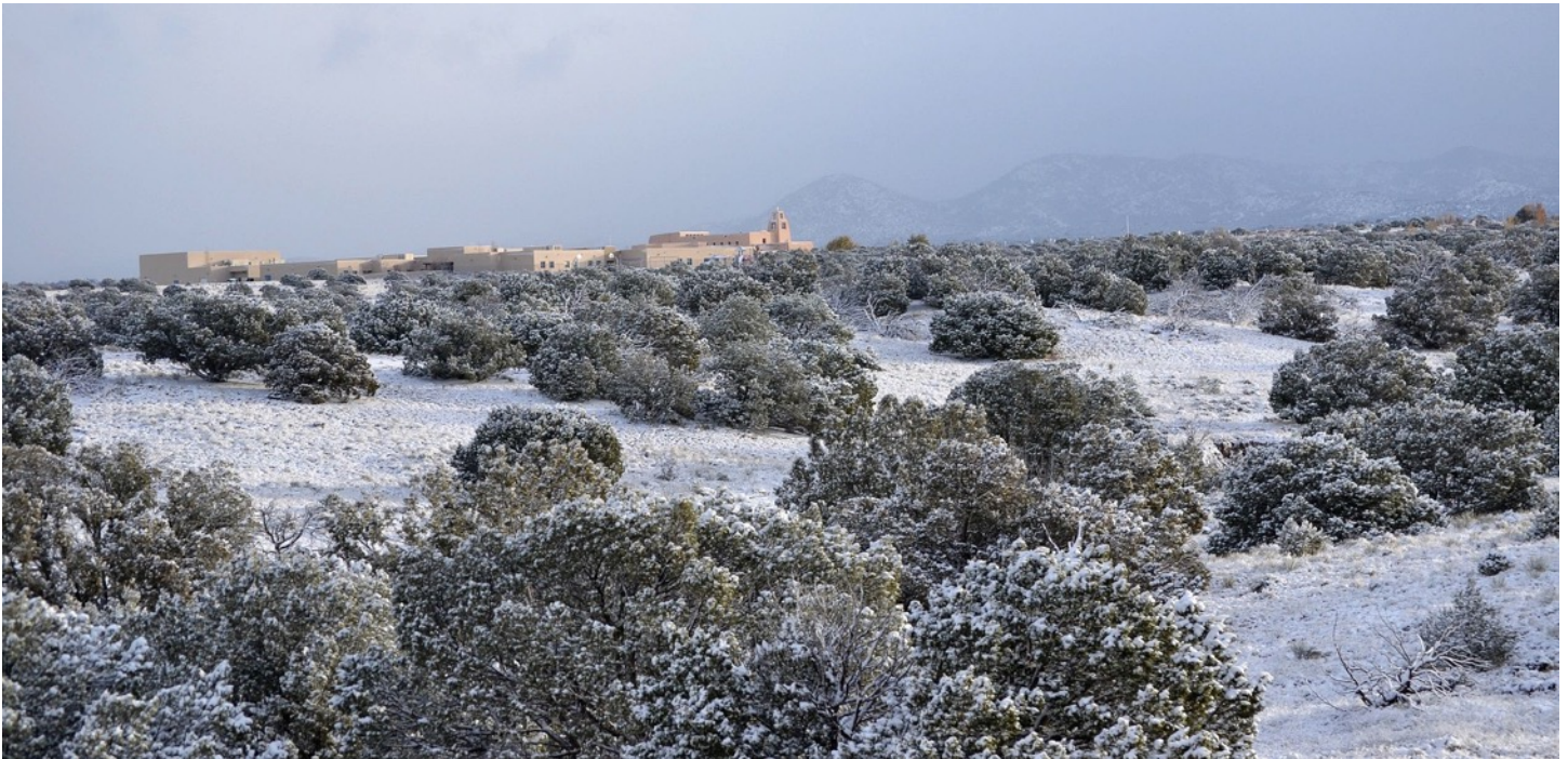
La Entrada Winter, November 16, 2015