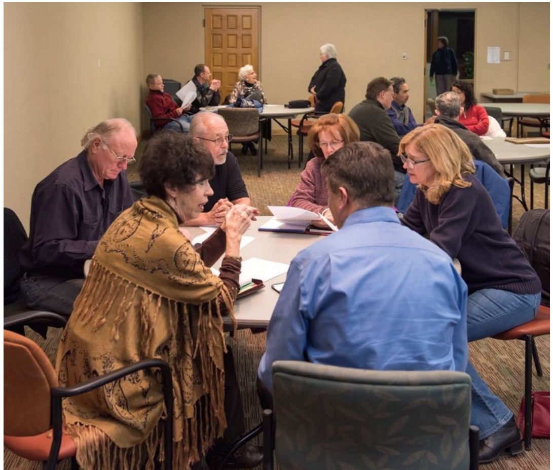
Rancho Viejo residents agree to an Effluent Advisory Board to determine direction for effluent usage.