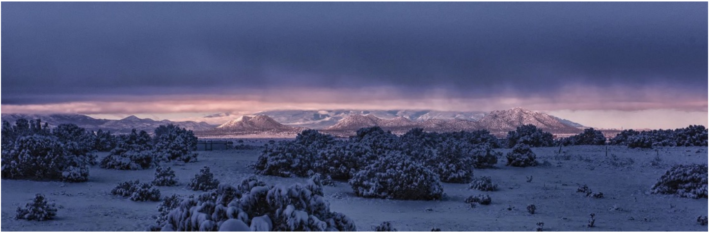
Clearing Storm, Cerrillos Hills, December 13, 2015