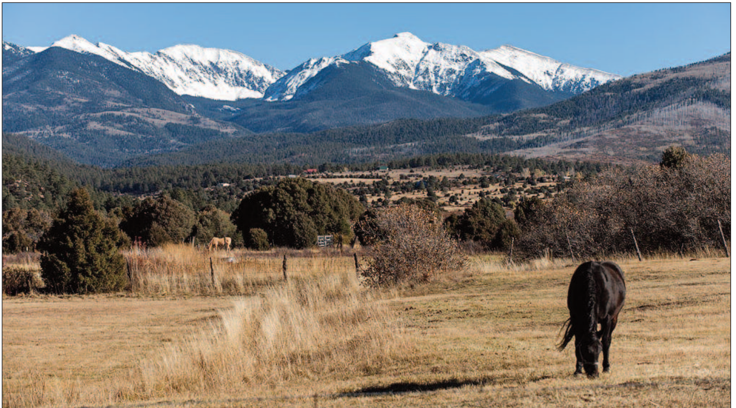
Another La Entrada panoramic view, this time grazing horse in front of snow-covered Truchas Peaks.