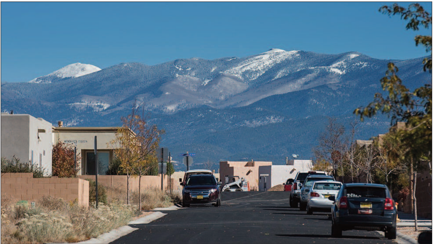
A Rancho Viejo La Entrada panorama reveals snow on the Sangre de Cristo mountains as winter begins.