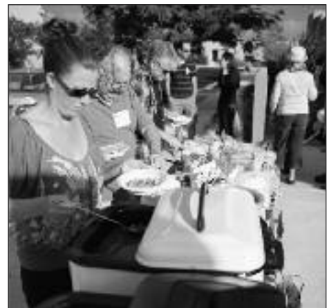
The Fiesta Court joined in the fun at La Entrada's Community Fiesta Picnic where hot dogs and frito pies were served.