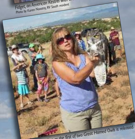
The crowd watches as the first of two Great Horned Owls is released.