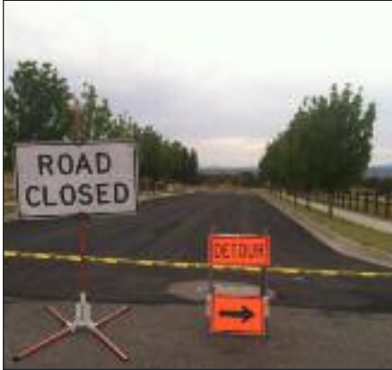
Signs of September road repairs appear in RV South. La Entrada repairs were completed earlier in the year.