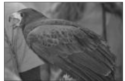
Wolfe the Harris Hawk looks ready for his close up.