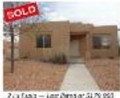
2131 Tapia — Last Sold at $179,950

I recently just sold this home and I can sell your home too!